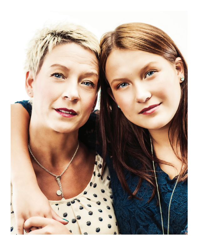
Anyone can be a victim. We strive to ensure everyone can become a survivor.

CALL 243-2333 625 SILVER SW, SUITE 200 ALBUQUERQUE, NM OPEN M-F I 8AM-5PM EMERGENCY SERVICE 24 HOURS INTERPRETER SERVICES AVAILABLE